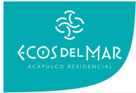
PROYECTO ARQUITECTÓNICO LOTE 24